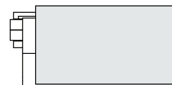
silicone lip projection: 5mm (±1mm)